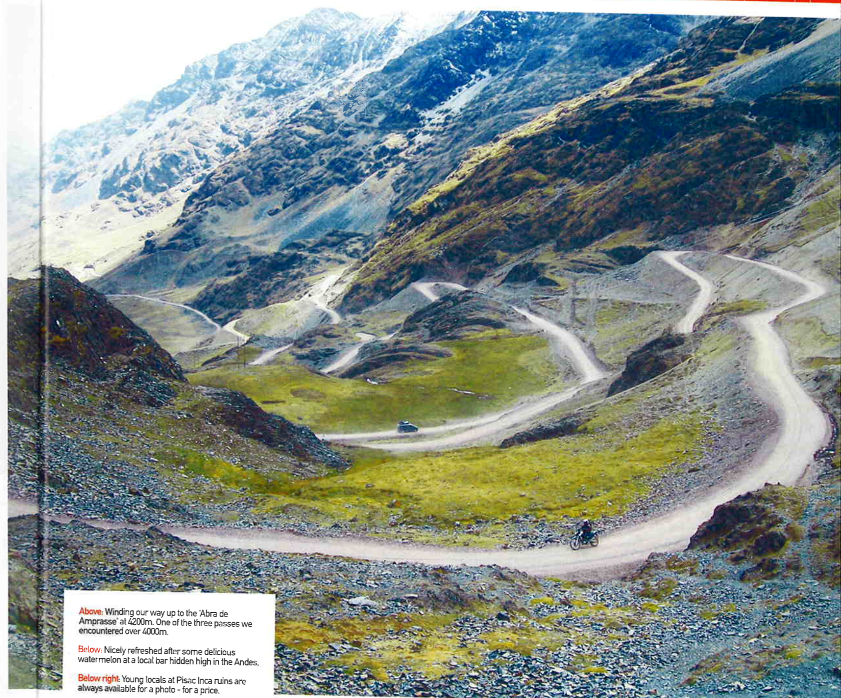
Above: Winding our way up to the 'Abra de Amprasse' at 4200m. One of the three passes we encountered over 4000m.

After settling into our hotel we enjoyed a welcome dinner with our hosts: Alex the tour guide and proprietor of PeruMotoTours, and Daniel, a professional archaeological guide (with a degree in South American culture). We were very pleased our hosts spoke good English and were as happy to see us as we were to be there. Altitude sickness is normal above 2500m and we all felt varying degrees of the symptoms; headache, dizziness and breathlessness. The trick is to take it easy for the first day or so and don't eat too much.